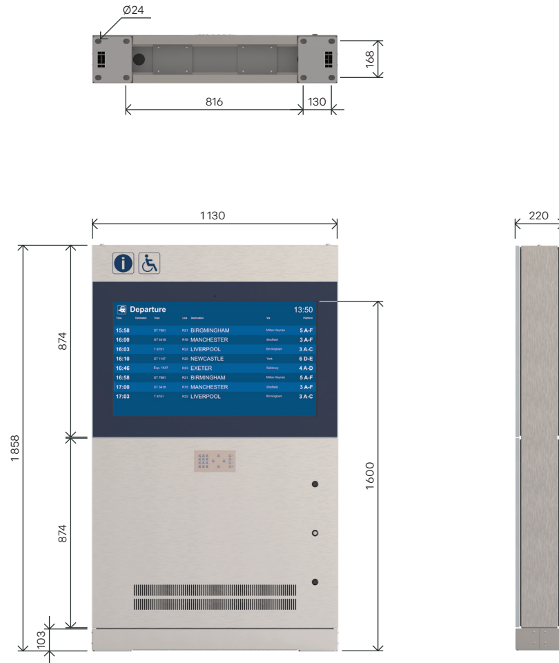
Single sided, mounting on top floor surface, stainless steel variant